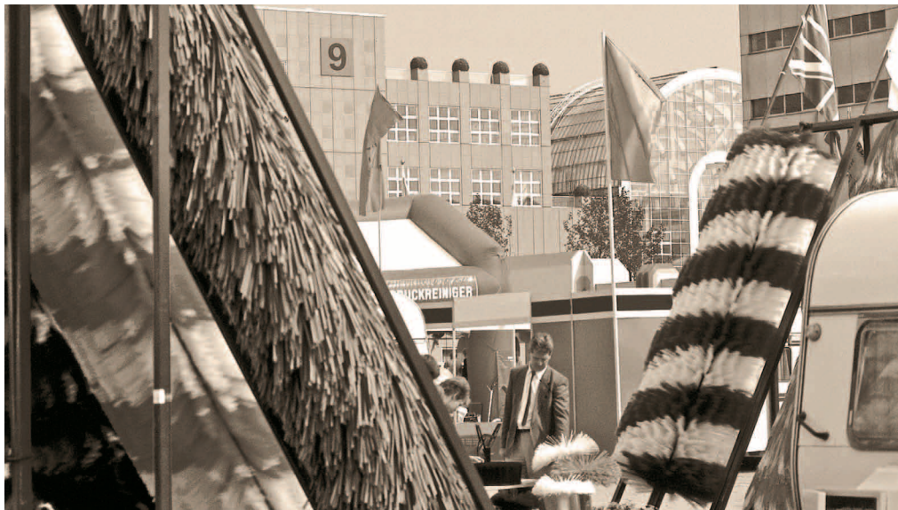
Memories of the early Automechanika years – washing brushes, which were also shown outdoors then. The first Automechanika in 1971 attracted around 500 exhibitors and 75,000 visitors from 63 countries to Frankfurt.

On the large outdoor area right next to the "Portalhaus" entrance you'll find manufacturers of gantry, in-bay and tunnel Car Wash facilities as well as washing chemicals. What's more, the adjacent Hall 10.0 offers great solutions for filling stations (e.g. fuel billing systems, filling station planning, construction and equipment, refuelling systems for alternative fuels, security surveillance and outdoor advertising). The offer is rounded off in Hall 9.1 with its comprehensive range of lubricants and vehicle care products.